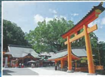
Kumano Nachi Taisha Grand Shrine