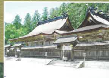
Kumano Hongu Taisha Grand Shrine