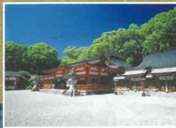
Kumano Hayatama Taisha Grand Shrine

-The only World Heritage River Pilgrimage Route-